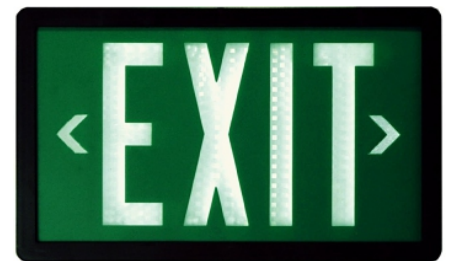
Sign shown in a lighted room