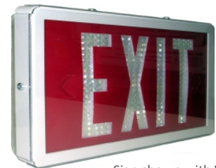
Sign shown with VS option