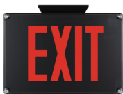
SENTRY WET LOCATION CDW