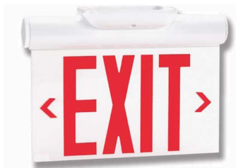
TRE6 Matching 6" Exit Sign