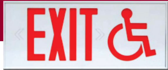
Meets the requirements of the State of Massachusetts