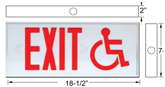
Dimensions in inches

Faceplate slides up and outward for quick and easy installation