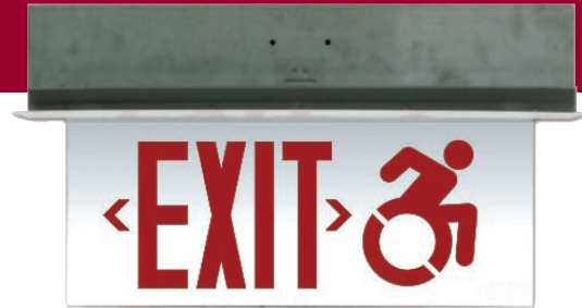
Meets CT code for 6" Exit with 6" dynamic ISA