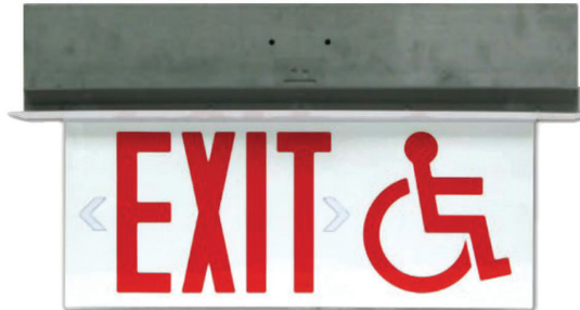
Meets the requirements of the State of Massachusetts