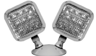
PRWLED2-MV Gray Double Outdoor Remote Head