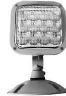
PRWLED1-MV Gray Single Outdoor Remote Head