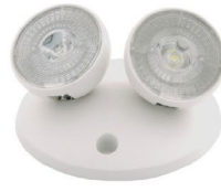
TCRH2 White Double Indoor Remote Head