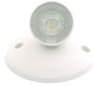
TCRH1 White Single Indoor Remote Head