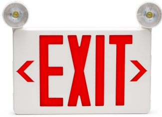
White Finish, Red Letter