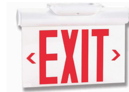
TRE6 Matching 6" Exit Sign