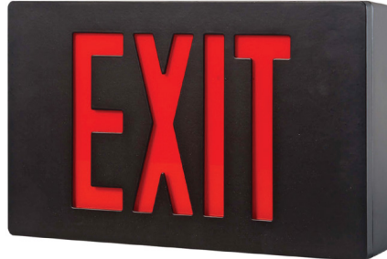
ALL BLACK WITH RED LETTERS