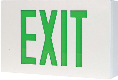
ALL WHITE WITH GREEN LETTERS