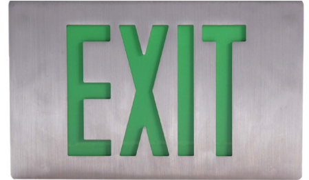
ALL BRUSHED ALUMINUM WITH GREEN LETTERS